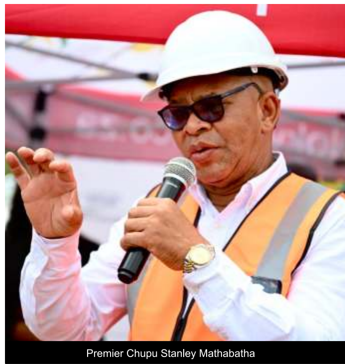
Premier Chupu Stanley Mathabatha