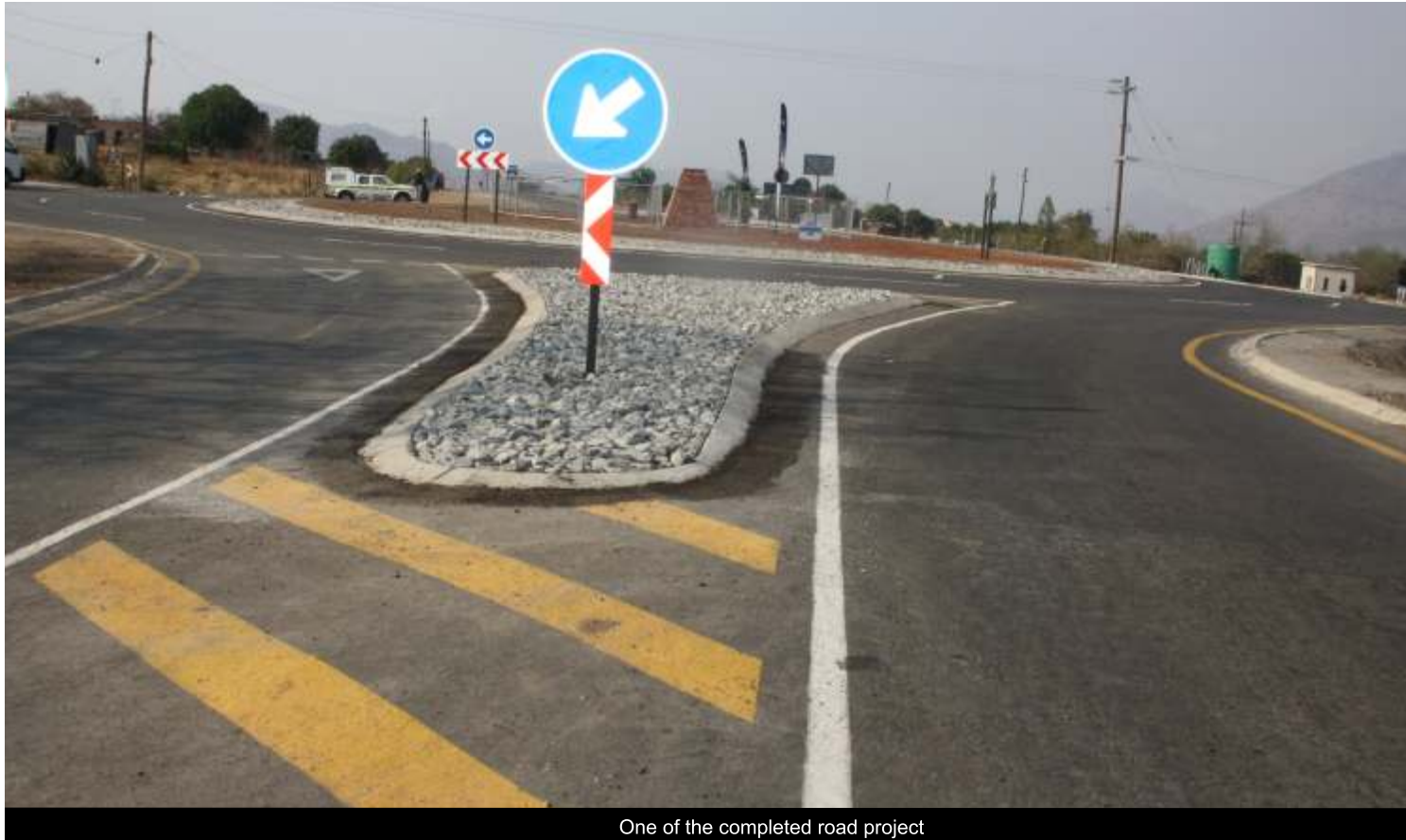
One of the completed road project