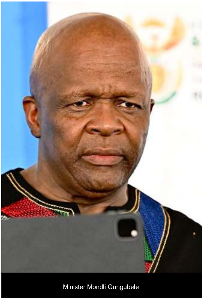
Minister Mondli Gungubele