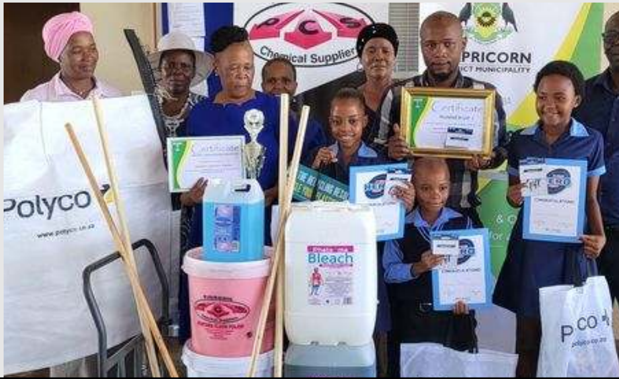
Bothanang Primary School during the awarding of prizes

We are excited about winning this prize.