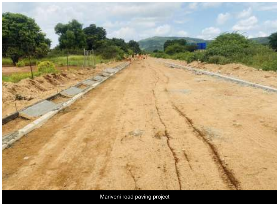
Mariveni road paving project

In a significant stride towards creating both infrastructure development and employment opportunities, the R57 million Zanghoma to Mariveni road paving project is well underway.