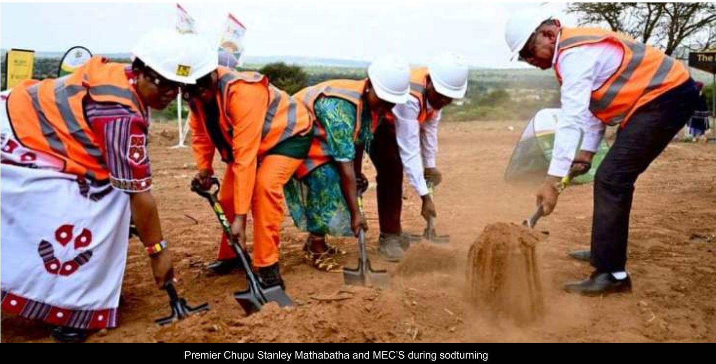
Premier Chupu Stanley Mathabatha and MEC'S during sodturning

Premier Chupu Mathabatha led the community in the ground-breaking sod turning of the Limpopo Provincial Theatre on Thursday,22 February 2024.This momentous event marks a significant milestone in the province's commitment to nurturing and showcasing the rich tapestry of artistic talent within Limpopo.