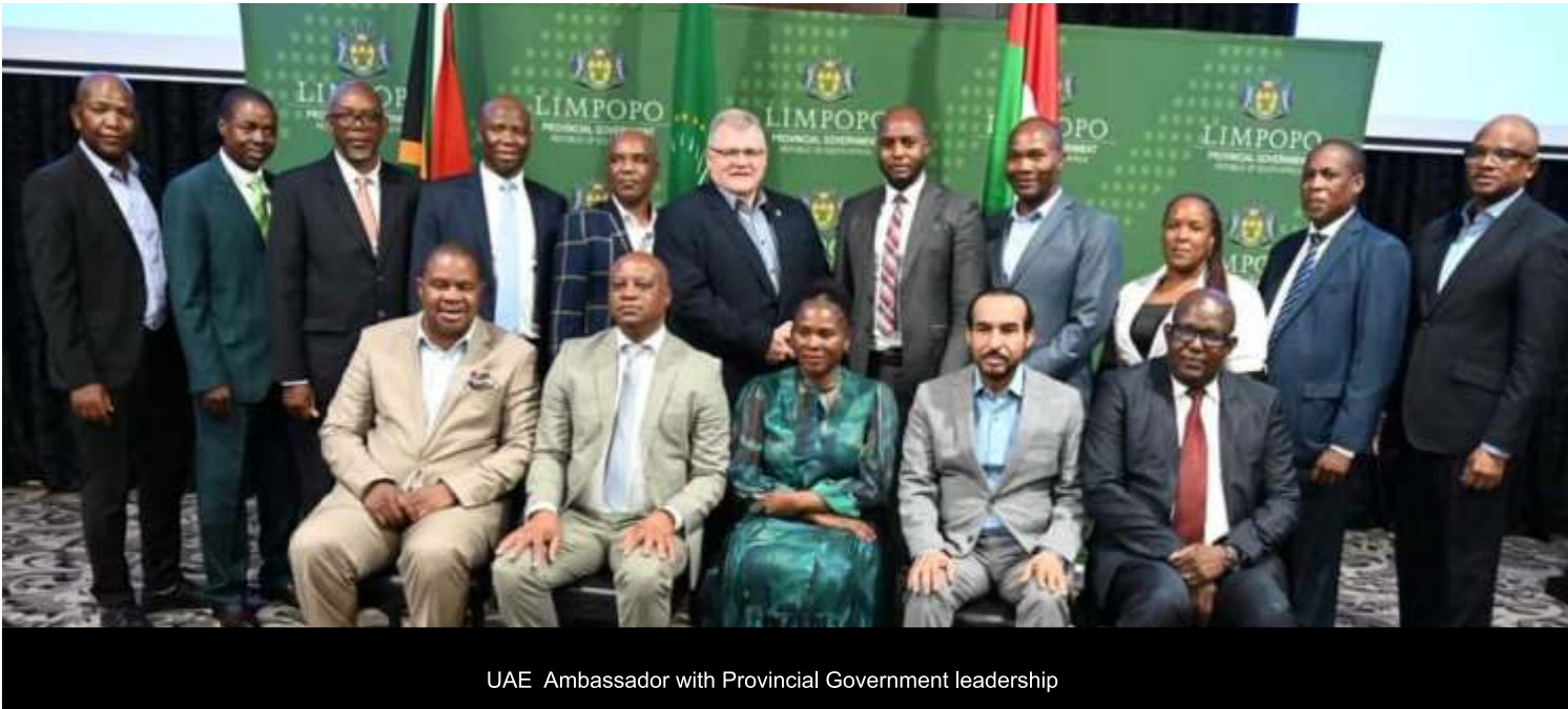
UAE Ambassador with Provincial Government leadership

The United Arab Emirates (UAE) is oil and natural gas reserves and are the world's sixth and seventh-largest economic hub, their visit was to assess the possibility of investing oil revenues into healthcare, education, and infrastructure. The country has the most diversified economy among the members of the Gulf Cooperation Council. In the 21st century, the UAE has become less reliant on oil and gas and is economically focusing on tourism and global hub for business starters Strengthening the bilateral relations between the province and UAE, the provincial government hosted ambassador Mahh Saeed Alhameli in Polokwane on 12 March to engage with investment prospects to bolster economic ties and explore investment opportunities between the two countries. South Africa and UAE enjoy this robust partnership anchored in the shared vision since 1994 with South African companies tapping into the lucrative UAE market which benefits sectors and growth. During the presentation which was attended by MECs from Agriculture, Transport and Community Safety and accounting officers led by MEC Seaparo Sekwati, presented investment opportunities by Musina Makhado and Fetakgomo Tubatse SEZ. The UAE has shown interest in investing at the Gate Way Polokwane for logistic hub, agriculture for the export of grain particularly rice which is the most basic in the country.