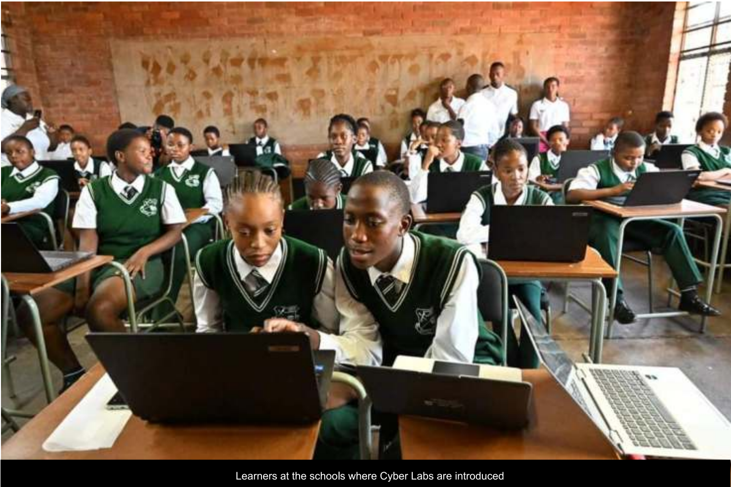
Learners at the schools where Cyber Labs are introduced