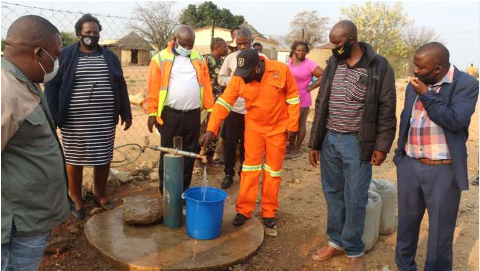
The Executive Mayor of Mopani District Municipality Cllr Pule Shayi has lauded the leaders of Ward 5 in the Maruleng Municipality for ensuring that the short-term water project is completed without interruptions.

He was speaking during his visit to Santeng village where he handed over water project implemented as part of the Covid-19 intervention programme.