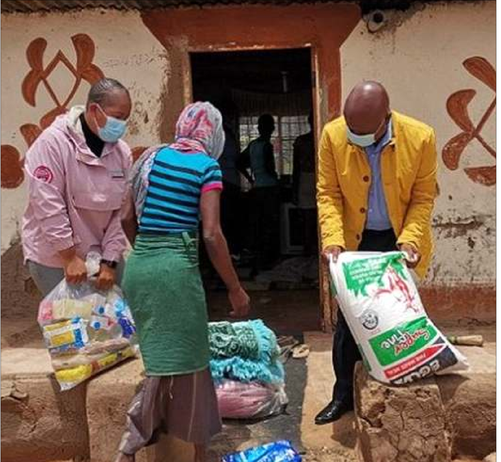
MEC of Social Development Nkakareng Rakgoale at Madimbo Village in the Musina Municipality.

M ost of families were rescued from their flooded homes after heavy rainfall in Vhembe District. A bridge connecting one of the rural area with Musina town was swept away by an overflowing river.