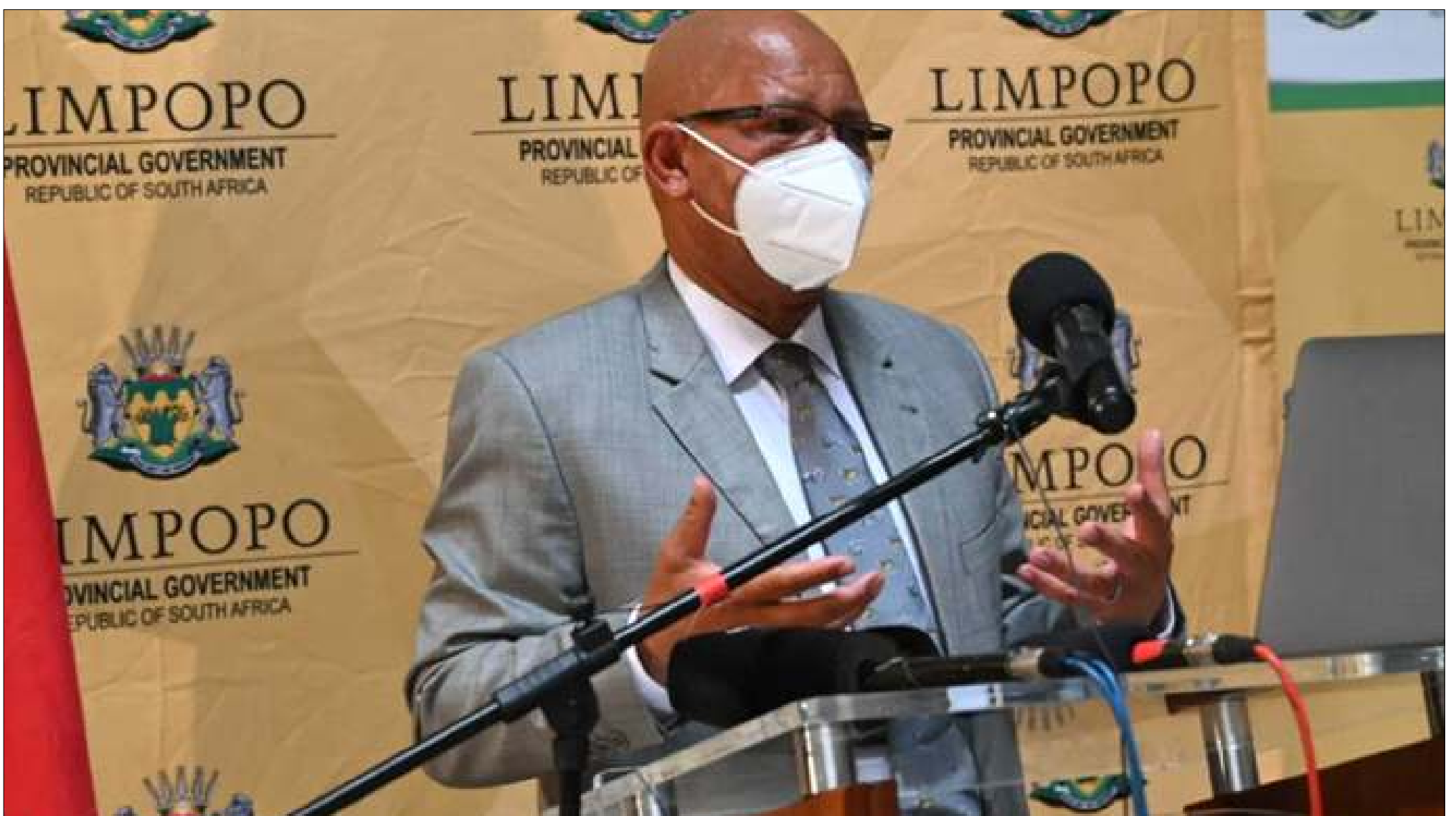
Premier Chupu Stanley Mathabatha During the media briefing about COVID-19 Vaccine Rollout Plan.

P remier Mr Chupu Mathabatha says Limpopo Provincial Government has set up structures to implement the COVID-19 Vaccine Rollout Plan.