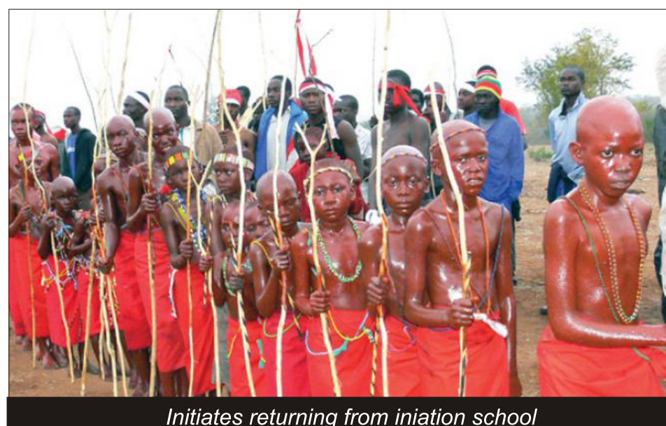
Initiates returning from initiation school

During the Briefing, MEC Makamu reported the number of initiates that have enrolled at approved schools had almost doubled from 393 in 2019 to 731 this year. Out of this number, 485 are for males and 246 females. From the grand total of 731 applications