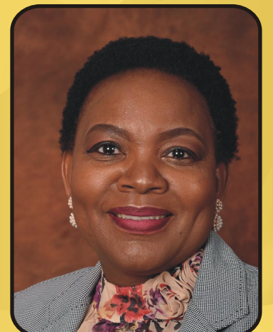
Ms Mavhungu Lerule-Ramakhanya MEC: Department of Education