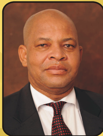
Mr Chupu Stanley Mathabatha Premier of Limpopo Province