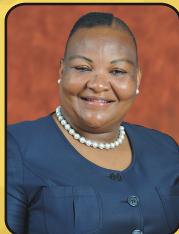
Ms Polly Boshielo MEC: Department of Transport and Community Safety