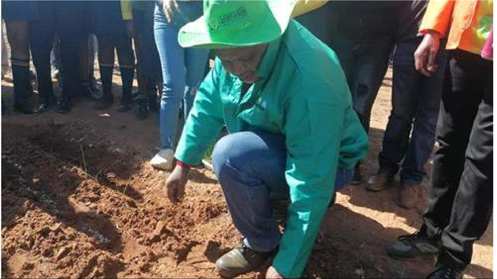
MEC Thabo Mokone demonstrating mix in compost planting method

Limpopo Department of Agriculture and Rural Development (LDARD) MEC Thabo Mokone has demonstrated