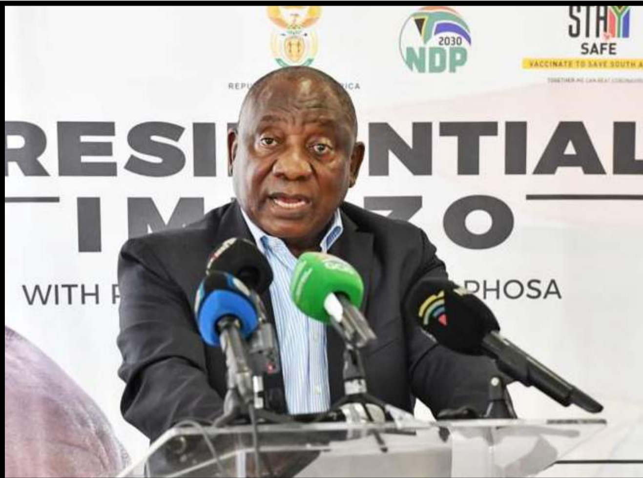
President Cyril Ramaphosa delivering his keynote address during the Presidential visit in Limpopo