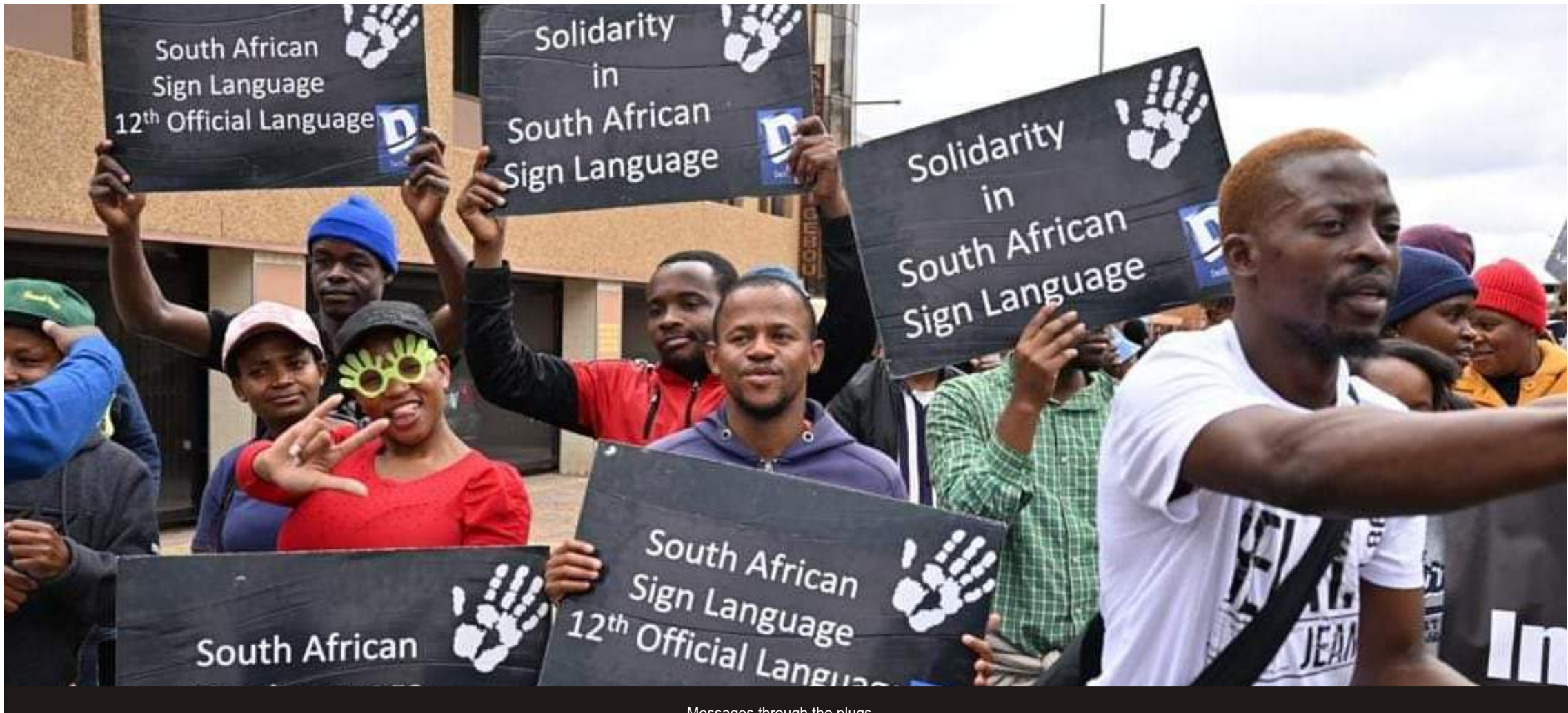
Messages through the plugs

Since the proclamation of the sign language bill in July 2023 to make sign language the 12<sup>th</sup> official language in South Africa, there has been numerous platforms to raise awareness.