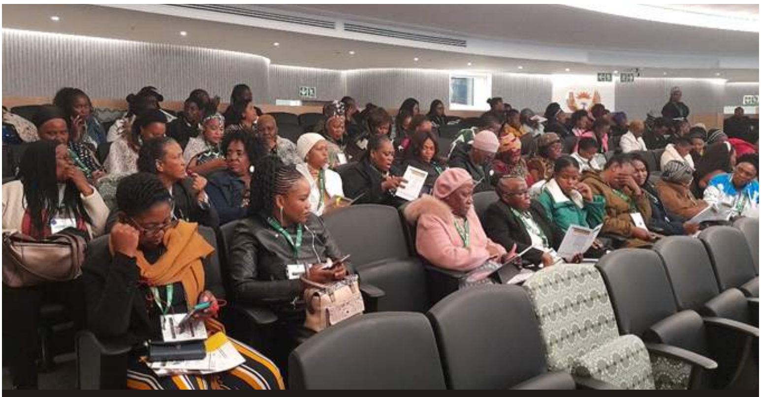
Women in Agriculture Sector attending a symposium in Pretoria

This number included internal government participants like DALRRD and its provincial departments representatives and Entities (NAMC, ARC, FRUITSA, OBP) and external government participants like: Small